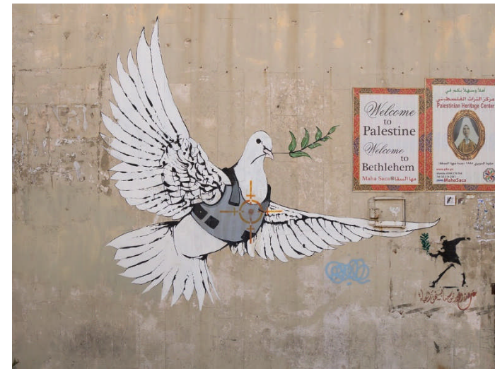
Banksy. Armoured Peace Dove . (2007) West Bank Wall. Palestine.